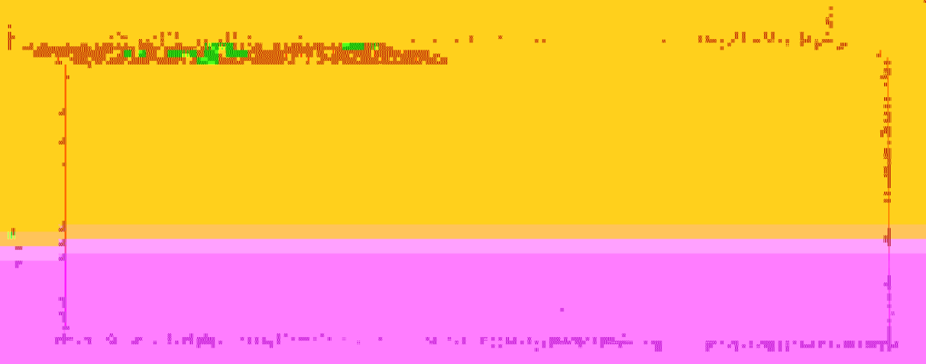
Diagram illustrating the structural layout of a building, showing the arrangement of columns and beams across multiple levels. The diagram is labeled with '1000' at the top and '0' at the bottom, indicating the vertical extent of the structure.