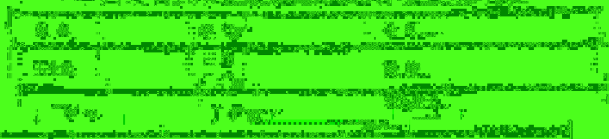
Diagram illustrating the structural layout of a building, showing the arrangement of columns and beams across multiple levels. The diagram is labeled with '1000' at the top and '0' at the bottom, indicating the vertical extent of the structure.